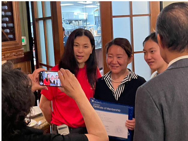
Design Fly of Event